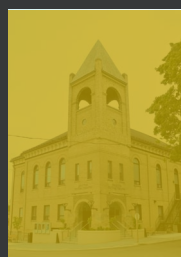
Drayton Festival Theatre 519-638-5511 ext. 233