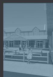
Huron Country Playhouse 519-238-8387 ext. 50