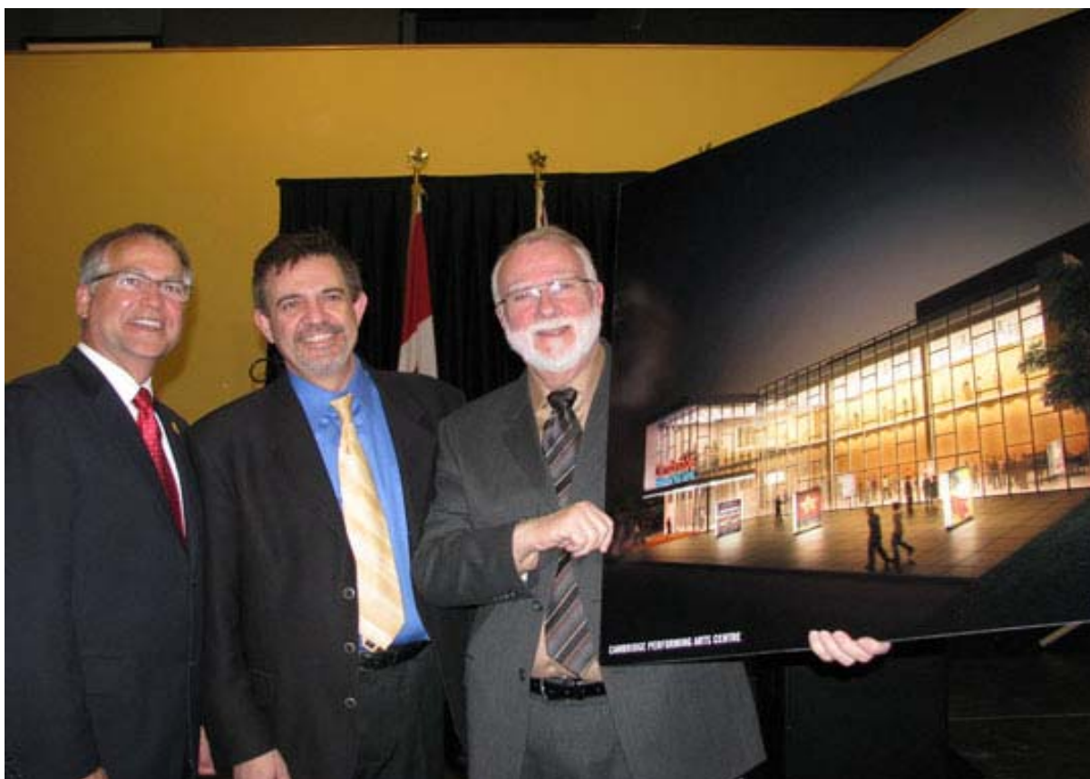
Front Entrance CPAC faces Grand Avenue